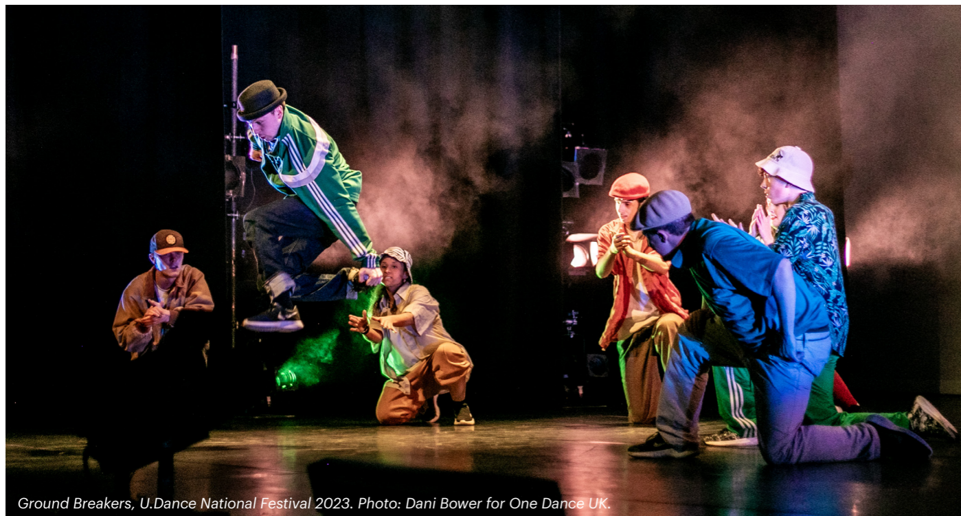
Ground Breakers, U.Dance National Festival 2023.