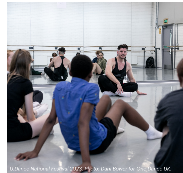
U.Dance National Festival 2023.