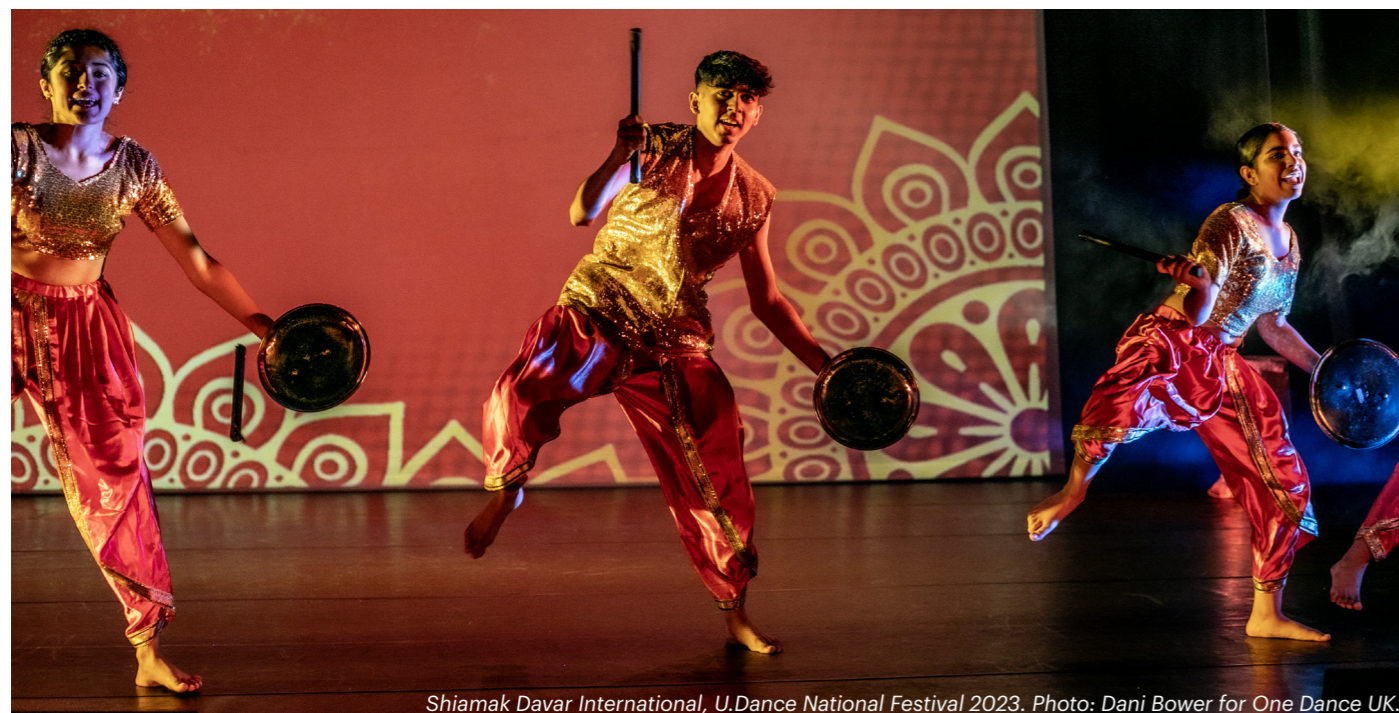
Shiamak Davar International, U.Dance National Festival 2023.

If music rights are not secured, for the online showcase the U.Dance Regional Platform organiser will overlay the track with similar royalty-free music.