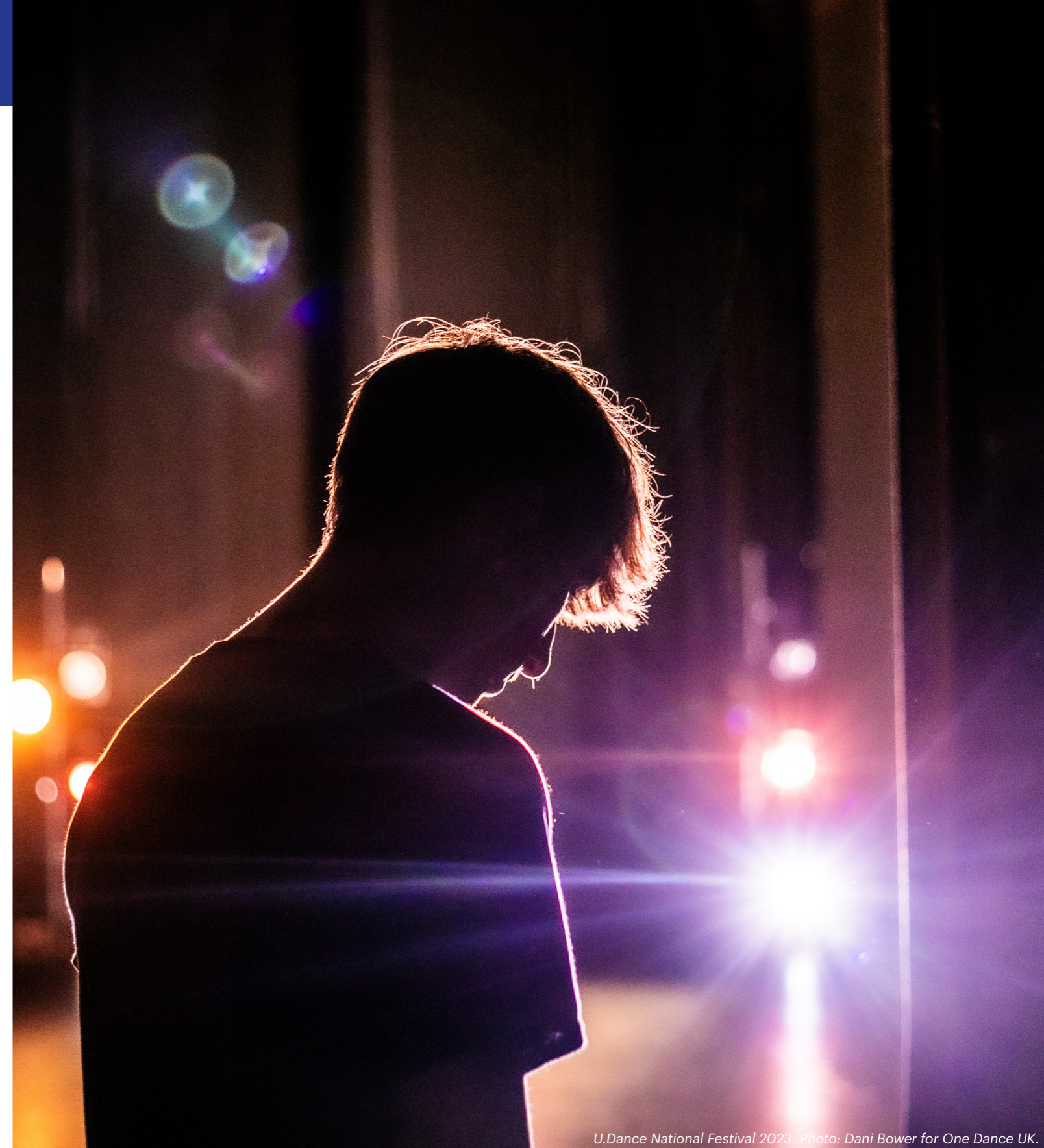
U.Dance National Festival 2023.

TRINITY LABAN CONSERVATOIRE OF MUSIC & DANCE