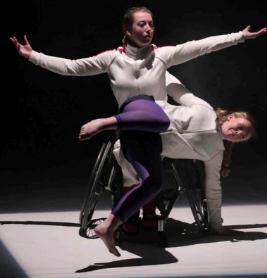
NYDC England, U.Dance National Festival 2023.

National Youth Arts Wales nyaw@nyaw.org.uk