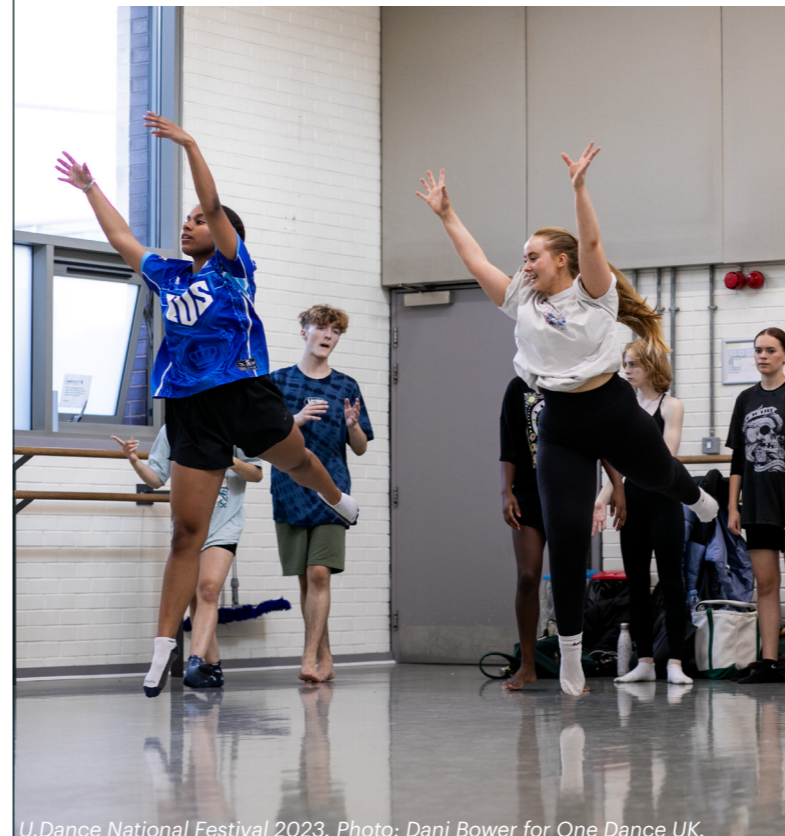
U.Dance National Festival 2023.