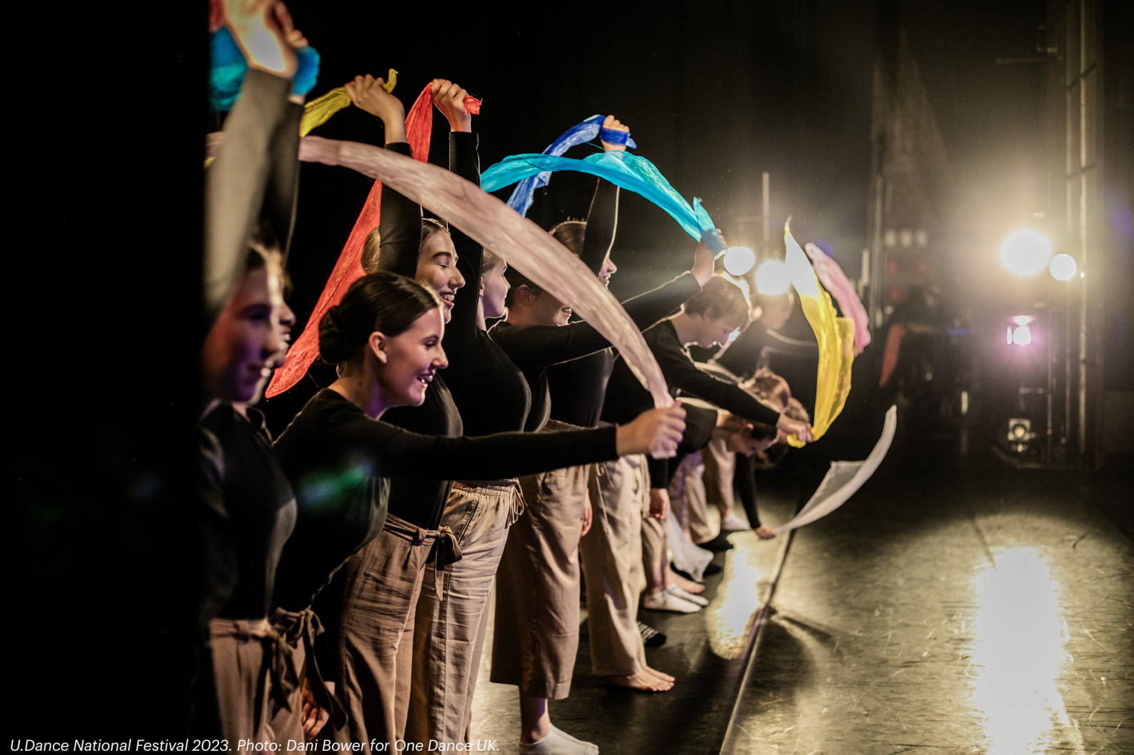
U.Dance National Festival 2023.