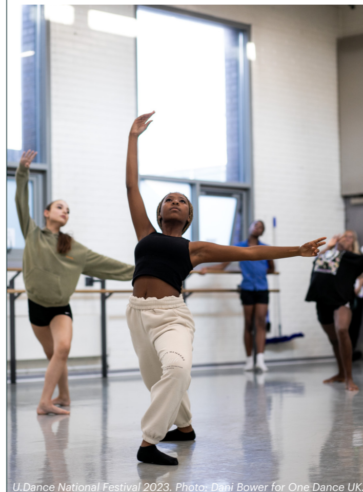
U.Dance National Festival 2023.

A selection panel will select a small number of groups from each U.Dance Regional Platform to have their work showcased at the U.Dance National Festival 2024. Further information relating to the National Panel and criteria are detailed later in this Application Pack.