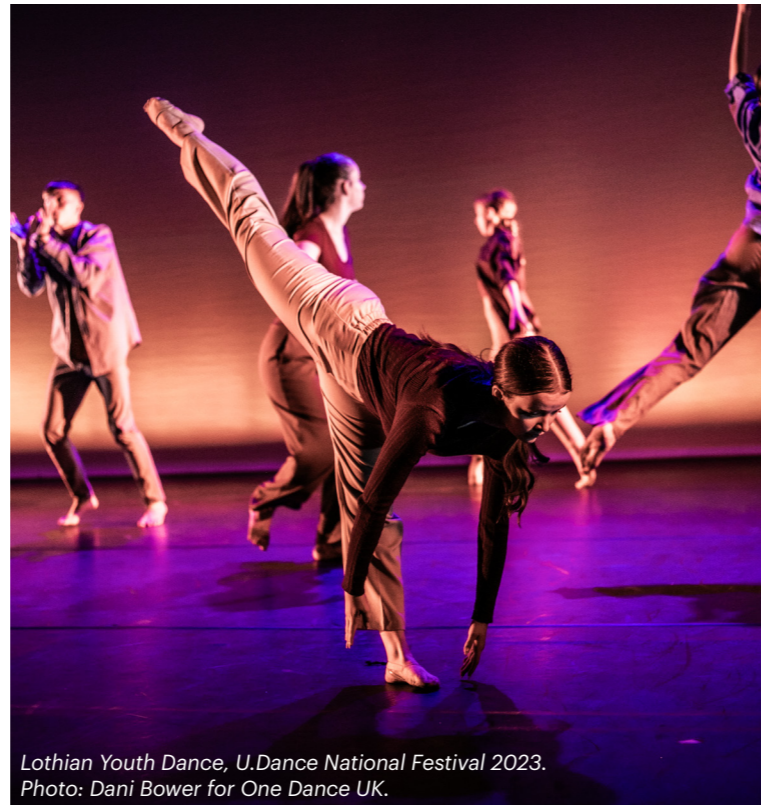
Lothian Youth Dance, U.Dance National Festival 2023.