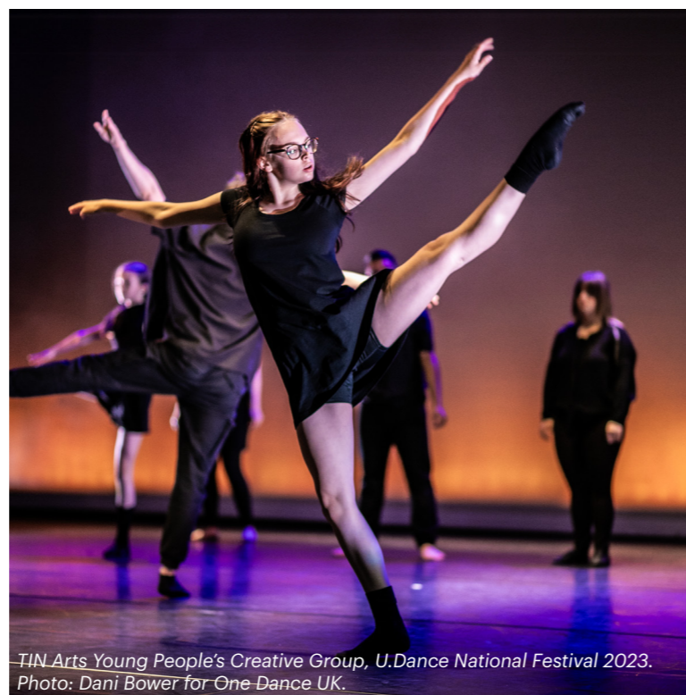
TIN Arts Young People's Creative Group, U.Dance National Festival 2023.