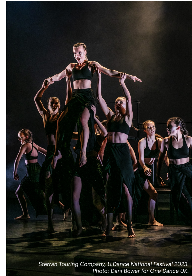
Sterran Touring Company, U.Dance National Festival 2023.

The structure and exact timeline of each U.Dance Regional Platform is unique, and each will have its own application and selection process. Please contact your U.Dance Regional Platform representative for details using the contact information below.